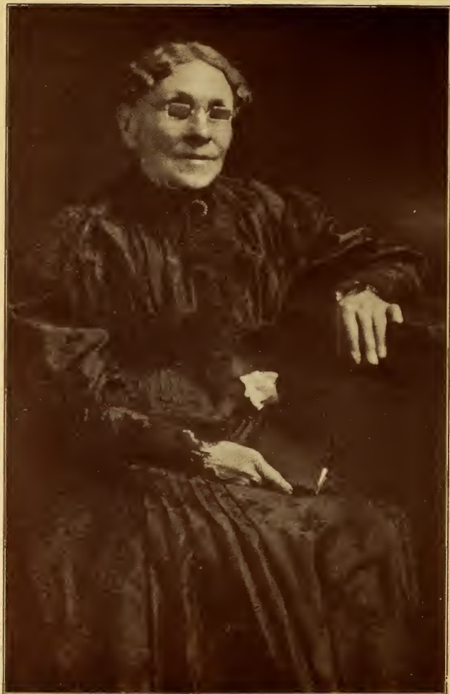
Fanny Crosby (Frances Jane Crosby Van Alstyne)